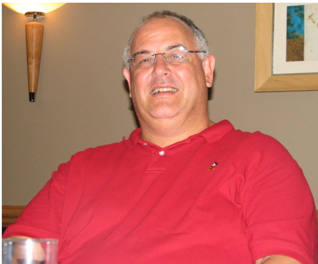
One of the “Good!” Guys ...

Congress then approved a Special Application by CZE for World Cup XII Postal Final to be an international title event.